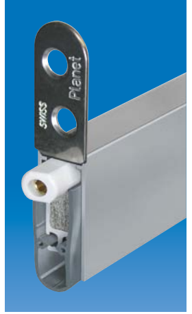
Planet HS with fastening bracket, release side