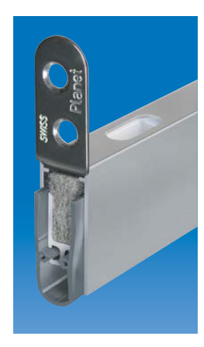
Option: Planet HS with Drill hole 5×13 mm