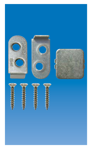
Planet assembly set HS