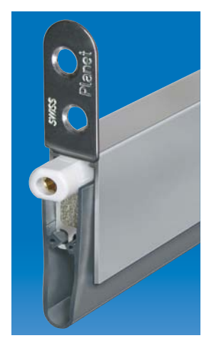
Option: Planet HS+8 with retaining bracket, release side