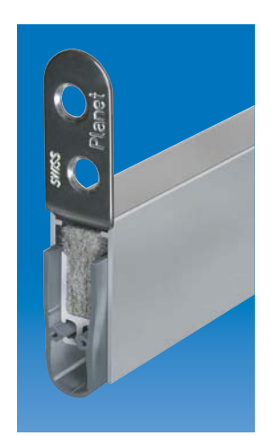
Planet HS profile