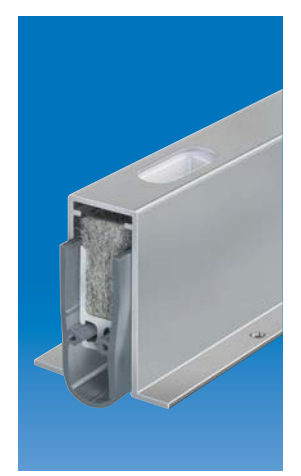
Option: Planet FT with Planet Drill hole 5×13 mm