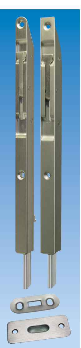
Planet KR flush bolt, incl. strike plate, refer to chapter Flush bolt Drill hole. Option: floor recess plate 5×13 mm, narrow