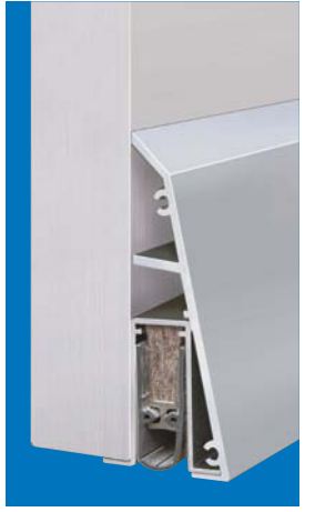
Option: Planet Socle without covering cap with Planet FT. Refer to chapter Planet Socle