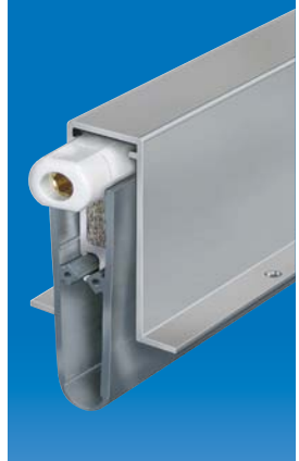
Option: Planet FT+8, release side