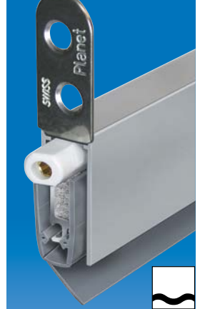
Planet RH with retaining bracket, release side