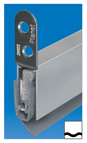
Planet RH profile