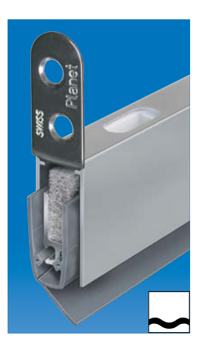
Option: Planet RH with Planet Drill hole 5×13 mm

Planet KR flush bolt, incl. strike plate, refer to chapter Flush bolt Drill hole. Option: floor recess plate 5×13 mm, narrow