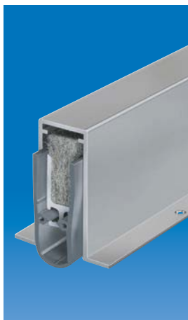
Planet FT profile