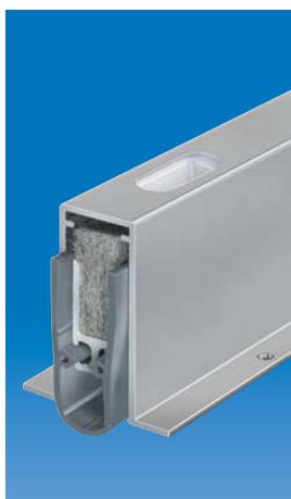
Option: Planet FT with Planet Drill hole 5×13 mm