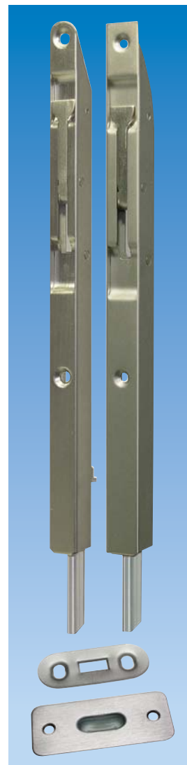
Planet KR flush bolt, incl. strike plate, refer to chapter Flush bolt | Drill hole. Option: floor recess plate 5×13 mm, narrow