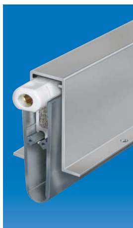
Option: Planet FT+8, release side