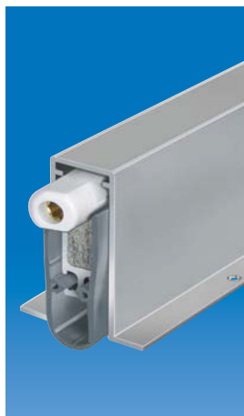
Planet FT, release side