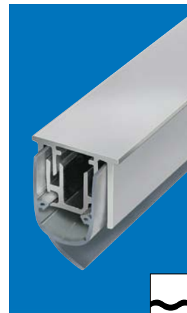
Option: Planet RS bevel lip for wavy floors